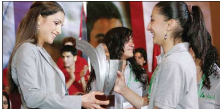
Queen Rania, INJAZ al-Arab's regional ambassador, honored "Teen Touch," the Palestinian student company that took top prize in the region's first INJAZ student company competition.

The student impact of INJAZ Palestine has increased by nearly 3,000 percent since its humble beginnings in 2005. Currently reaching 10,000 young people, the organization is truly changing the future of the region. In 2007, INJAZ Palestine – INJAZ means "achievement" in Arabic –