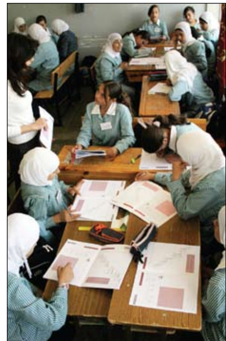
For an hour each week, these INJAZ Palestine students take time to focus on their futures and gain the tools to successfully contribute to their economy and enter the world of work. Corporate volunteers teach one of seven JA programs, bridging the gap between academics and the private sector.